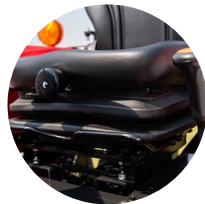
2. Comfortable suspension seat