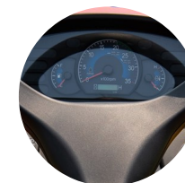
6. High visibility instrumental panel