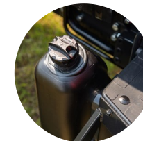
5. High-capacity fuel tank