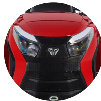
1. New iconic hood

Compact enough to give you the versatility you need, and powerful enough to take on the tougher jobs on and off the field.