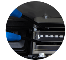
5. Draft Control