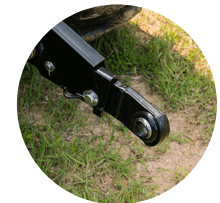
6. Extendable lower link ends