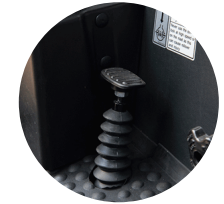
4. Differential Lock