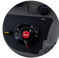
1. Selectable 4WD

The output of the T654 suggests it's a utility tractor and the turning radius suggests it's a compact tractor. Offering maximized power and ease of control, this compact utility truly brings you the best of both worlds.