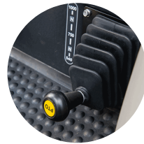
2. PTO shift lever