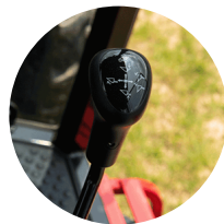
3. Loader Joystick