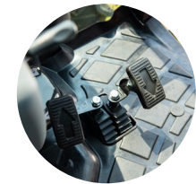
4. Highly responsive forward & reverse HST (4820CH)