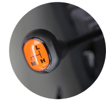
4. 3-range hydrostatic transmission