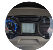
6. Digital instrument panel