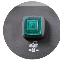
1. Cruise control switch

Take on tough jobs in tight spaces with the T574. This tractor brings you the best features from our compact and utility ranges, balancing high power output with maximized maneuverability.