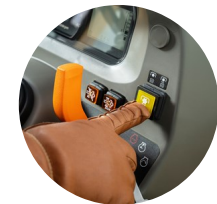
5. PTO switch