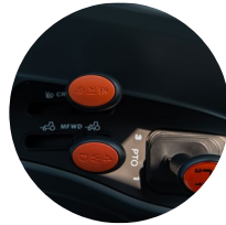
1. Low-speed / 4WD / gear shift lever

The K65 features car-like comfort on top of its formidable performance specs. It reduces operator stress with smart features and comprehensive controls like the sunroof, and horizontal level control.