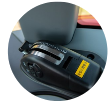
5. Electronic lift control