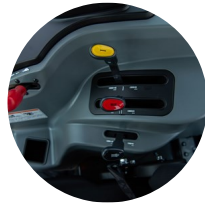
2. Ergonomic rear implement control lever