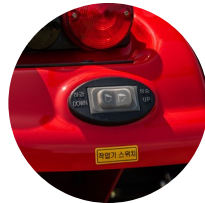
3. Implement height control