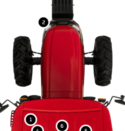
4. 3-range HST & 8F x 8R gear transmission