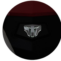
1. Backlit logo

TYM's flagship tractor combines sophisticated design, powerful performance, and premium features for operator convenience.