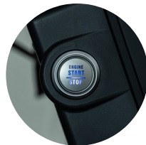
3. Push to start button