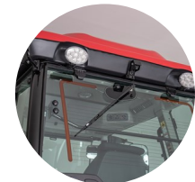
6. Heated rear window