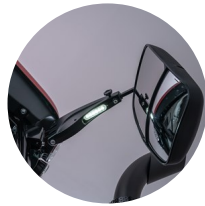
2. Sideview mirrors with LED