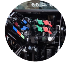
5. Rear external hydraulic port (hydraulic top link)