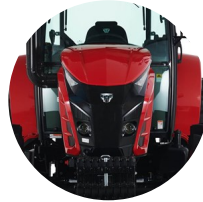
1. Tiger face front fascia

The T62 is the result of TYM's decades-long experience in the agricultural equipment industry and the embodiment of TYM's philosophy on technology, design, and agriculture.