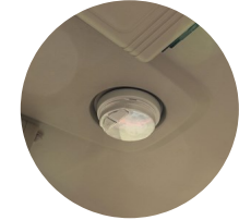
4. LED interior lighting