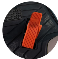
3. Electronic organ-type pedal