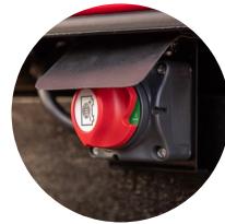
2. Battery shut-off switch