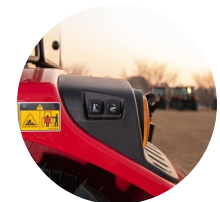
6. External hitch control buttons