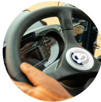
1. Power steering

The TJV985 is the standard imported tractor from our collaboration with Iseki, one of the largest and oldest Japanese manufacturers. Get the power you need from a utility tractor at a lower investment.