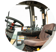
4. Cabin with full A/C and heating