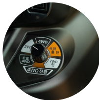
3. 4WD mode selector