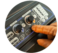
5. Electro-hydraulic hitch control system