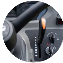
2. Throttle lever