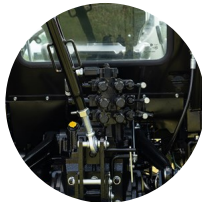
3. Rear external hydraulic valve