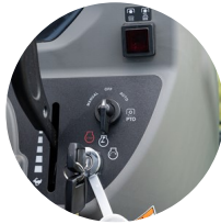
1. PTO mode switch (OFF, MANUAL, AUTO)

Take on tough jobs in tight spaces with the T58. This tractor brings you the best features from our compact and utility ranges, balancing high power output with maximized maneuverability.