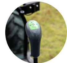
6. Loader joystick lever