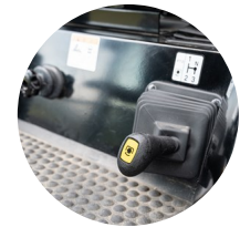
5. PTO lever