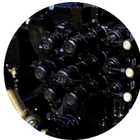
3. Rear external hydraulic valve