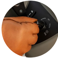
1. PTO mode switch (OFF, MANUAL, AUTO)

Take on tough jobs in tight spaces with the T58C. This tractor brings you the best features from our compact and utility ranges, balancing high power output with maximized maneuverability.