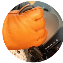
2. Throttle lever